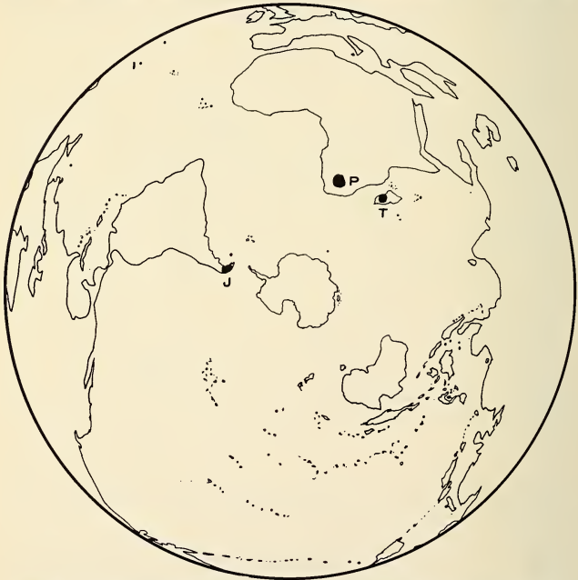
Fig. 2. Distribution of the three earliest evidences of salientians. "P" are footprints from Permian Ecca beds of South Africa; "T" represents Triadobatrachus from the Triassic of Madagascar; "J" is Vieraella from the Lower Jurassic of Patagonia. This figure and all of the following distribution maps are based on an Azimuthal Equidistant Projection, centered on the South Pole.

The earliest known remains of any salientian-type animal are some footprints found in the Ecca formation in the basal Permian of South Africa. The prints are of the fore-feet and indicate the presence of an animal that swam about or groveled on the bottom. The earliest fossilized skeleton is that of Triadobatrachus ( Protobatrachus ) from the Lower Triassic of Madagascar. This animal